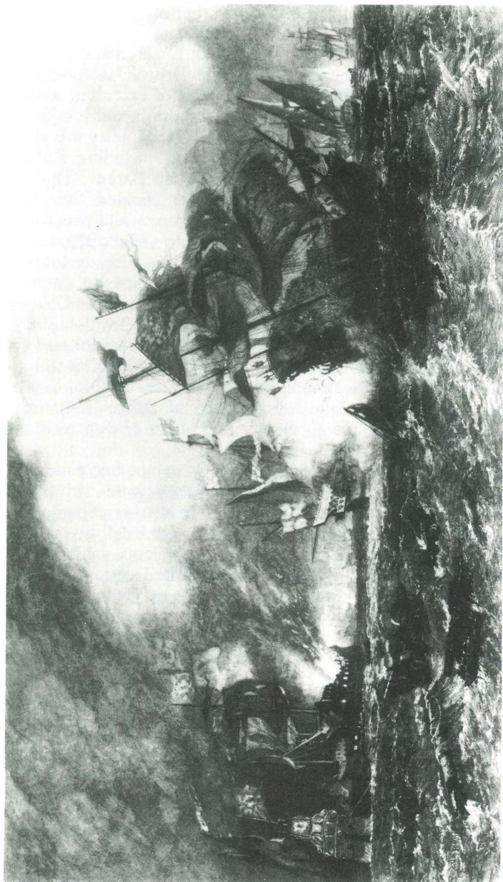
3. The Revenge in the battle.

safe harbour and the merchants were able to carry away their profits in specie, which they had great difficulty in doing from the Royal ports. 58