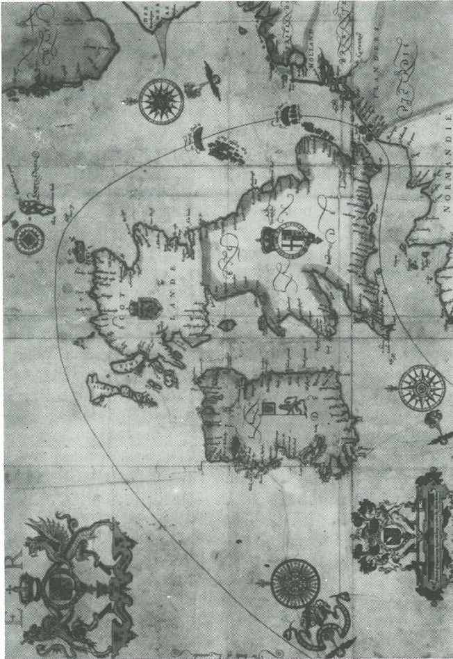
4. The track of the Armada, 1588.

accession of Philip III to the throne of Spain. In Antwerp there were rumours of peace and in London Sir Julius Caesar pondered the advantages of peace and the ancient trade with Spain, 'which for bringing in of money was very beneficiall to this realm'. 110